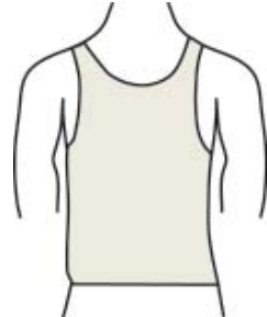
Muscle T-Shirt (Guys)