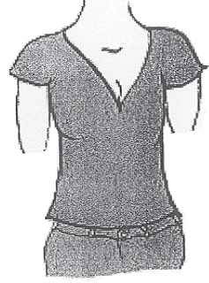
Low Cut Top